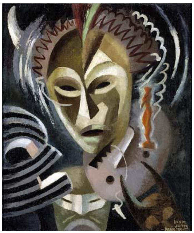
Fig. 1 [Les Fetiches, 1938, oil on linen]

as a medium between the people and a God-like entity, or in general, the world of the spirits. It was often believed that the masks represented a spirit of an ancestor; even more so, that the person who wears the mask is possessed by this spirit. The excessive stylization can be explained by traditional belief which puts an emphasis on the distinction between the essence and the surface of reality; hence the stylization that refers to the abstract nature of the reality that is not visible. [7, p. 188-191]